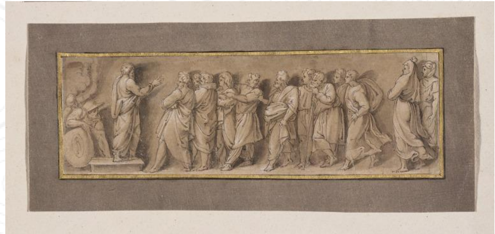
Raphael's Vatican Loggia Fresco : Joshua Talking to the People of Israel

10 So Joshua ordered the officers of the people: 11 "Go through the camp and tell the people, 'Get your provisions ready. Three days from now you will cross the Jordan here to go in and take possession of the land the LORD your God is giving you for your own.'"