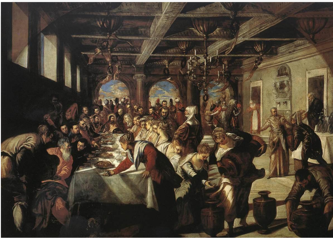
Parable of the Great Banquet