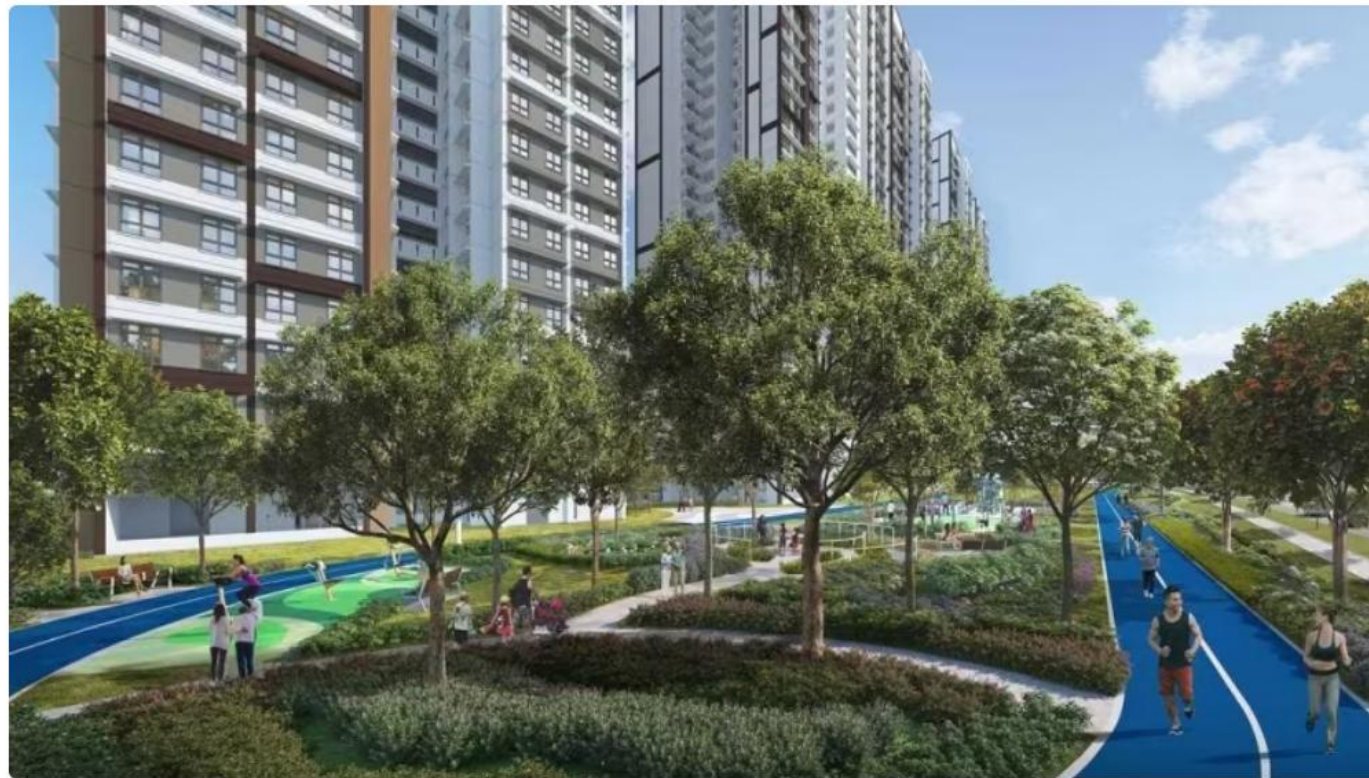
An artist's impression of the Tanjong Rhu Parc Front project in the February 2025 BTO sales exercise.

The Tanjong Rhu Parc Front project in Kallang Whampoa saw 4,232 applications for 812 BTO flats.